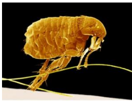
Cat Flea ( Ctenocephalides felis )

Fleas are a major inconvenience, but did you know they can also pose a serious health threat to you and your pet? Here's what you need to know to keep your house and pets free of fleas.